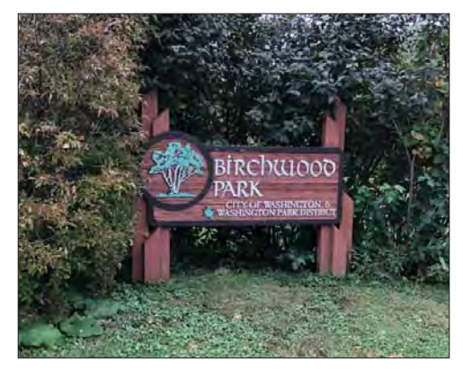
Park Identification Sign