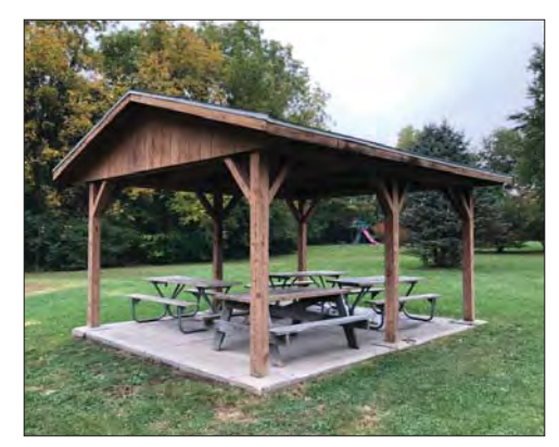
Shelter with picnic tables adjacent to parking lot