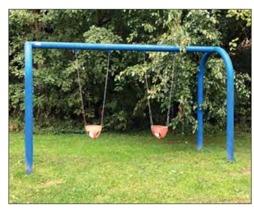
Swings (2 tot)