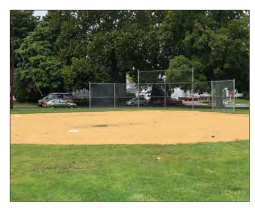
Backstop and Ballfield