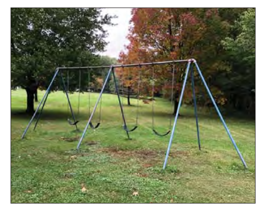
Swings (4 belt)