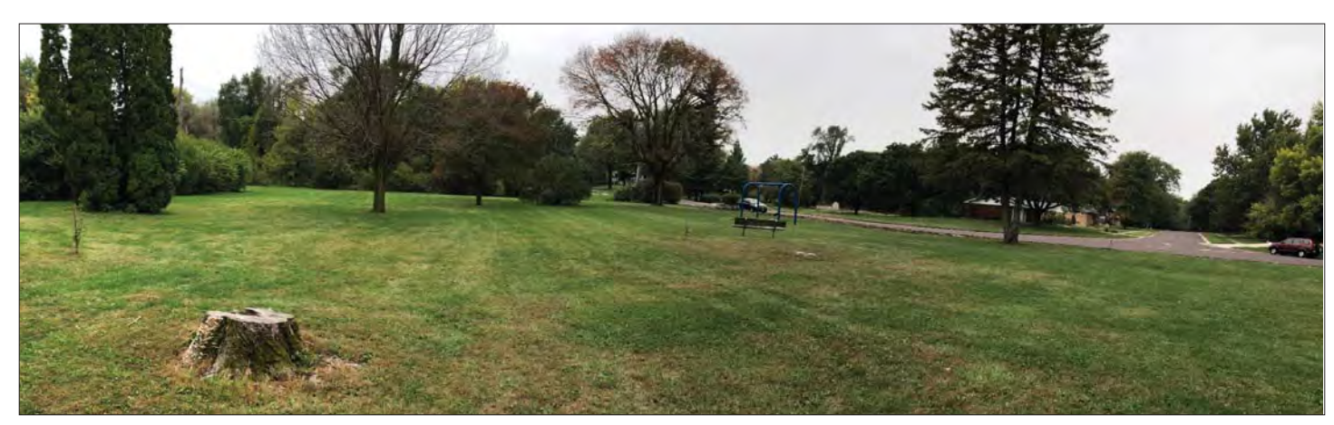
Swings (2 belt), Benches, and Open Space