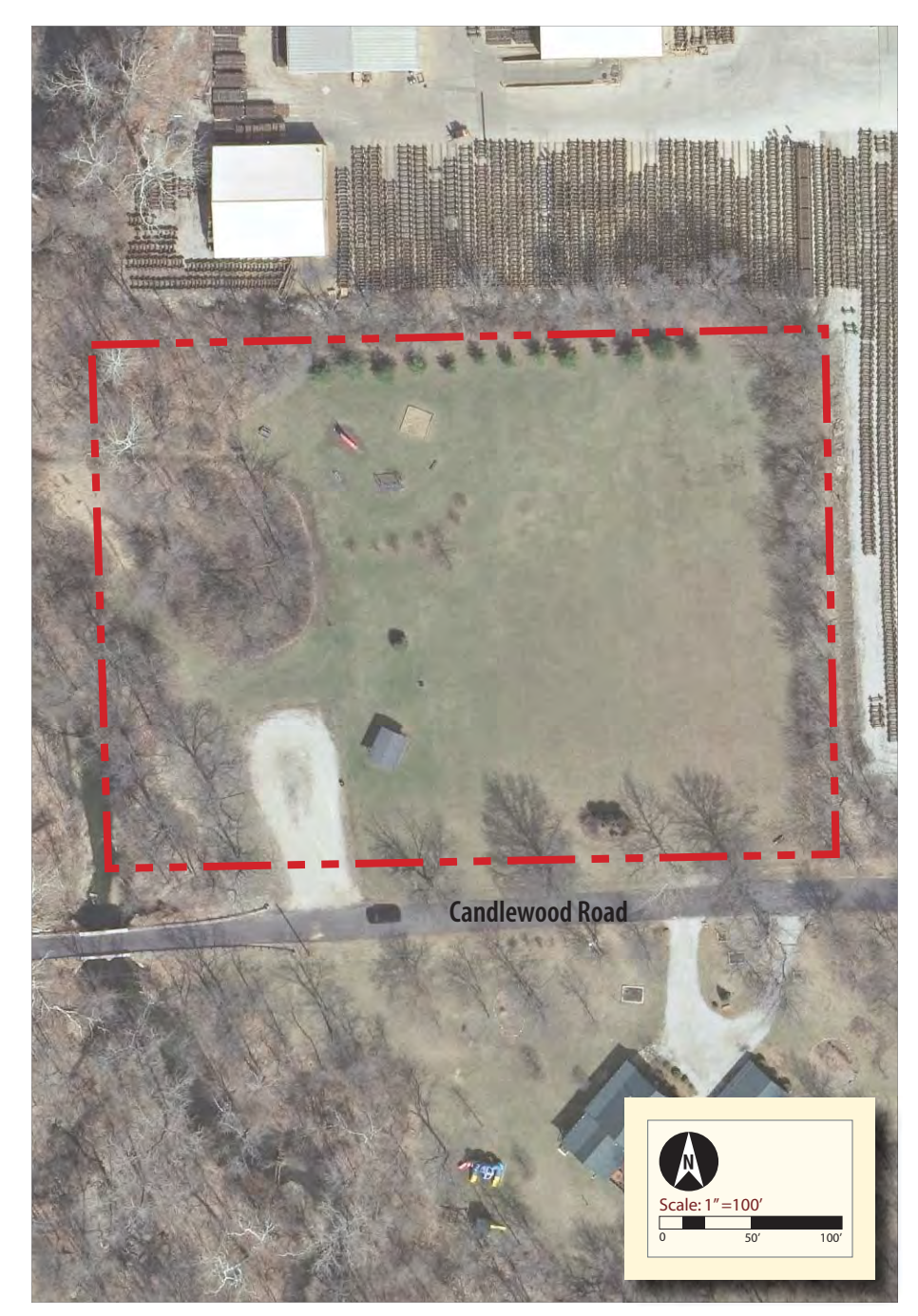
Aerial Photo of Candlewood Park