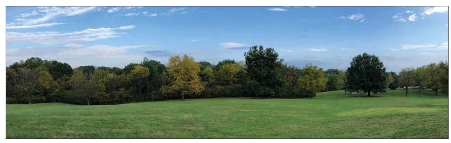
West Open Space and Mature Forestry