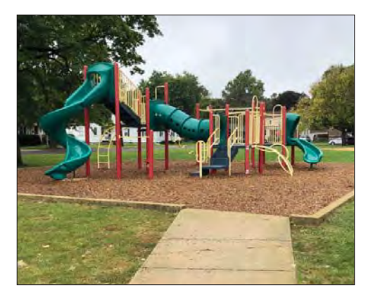
5-12 Play Structure