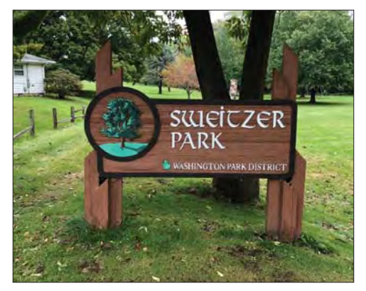
Park Identification Sign