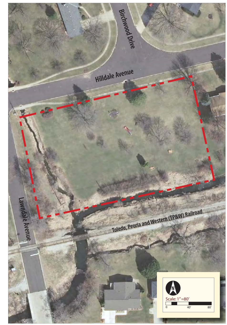
Aerial Photo of Birchwood Park