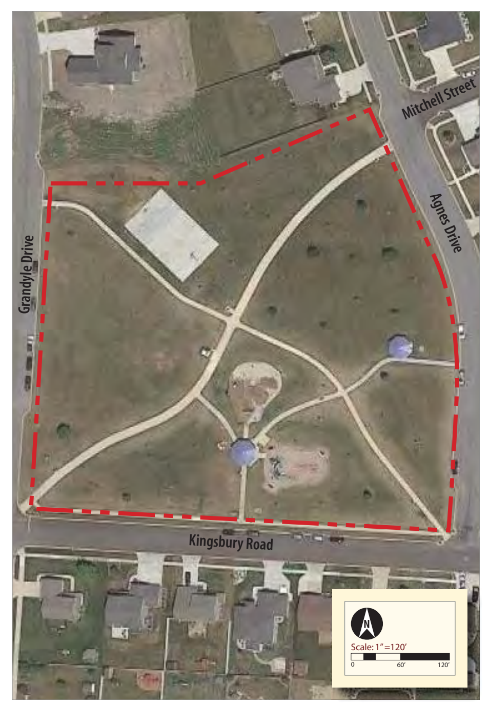
Aerial Photo of Harry LaHood Park