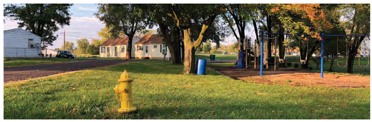
Swings (2 belt/2 tot) and street frontage