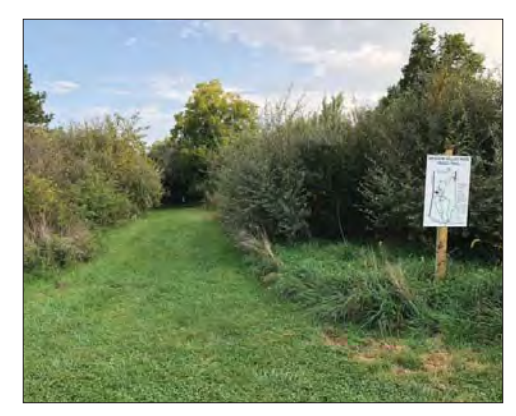
Trail and Wayfinding Signage