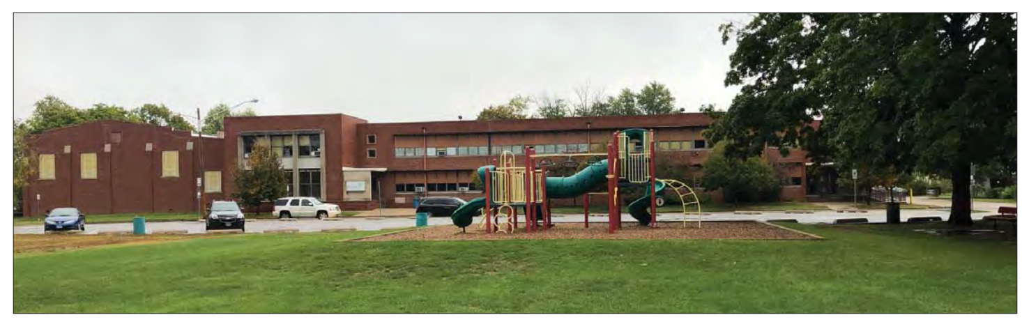
5-12 Play Structure and Parking Lot