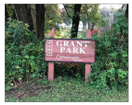
Park Identification Sign