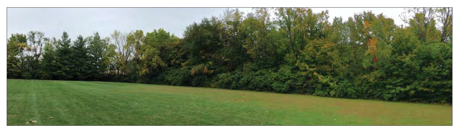
Open Space adjacent to shelter and parking lot