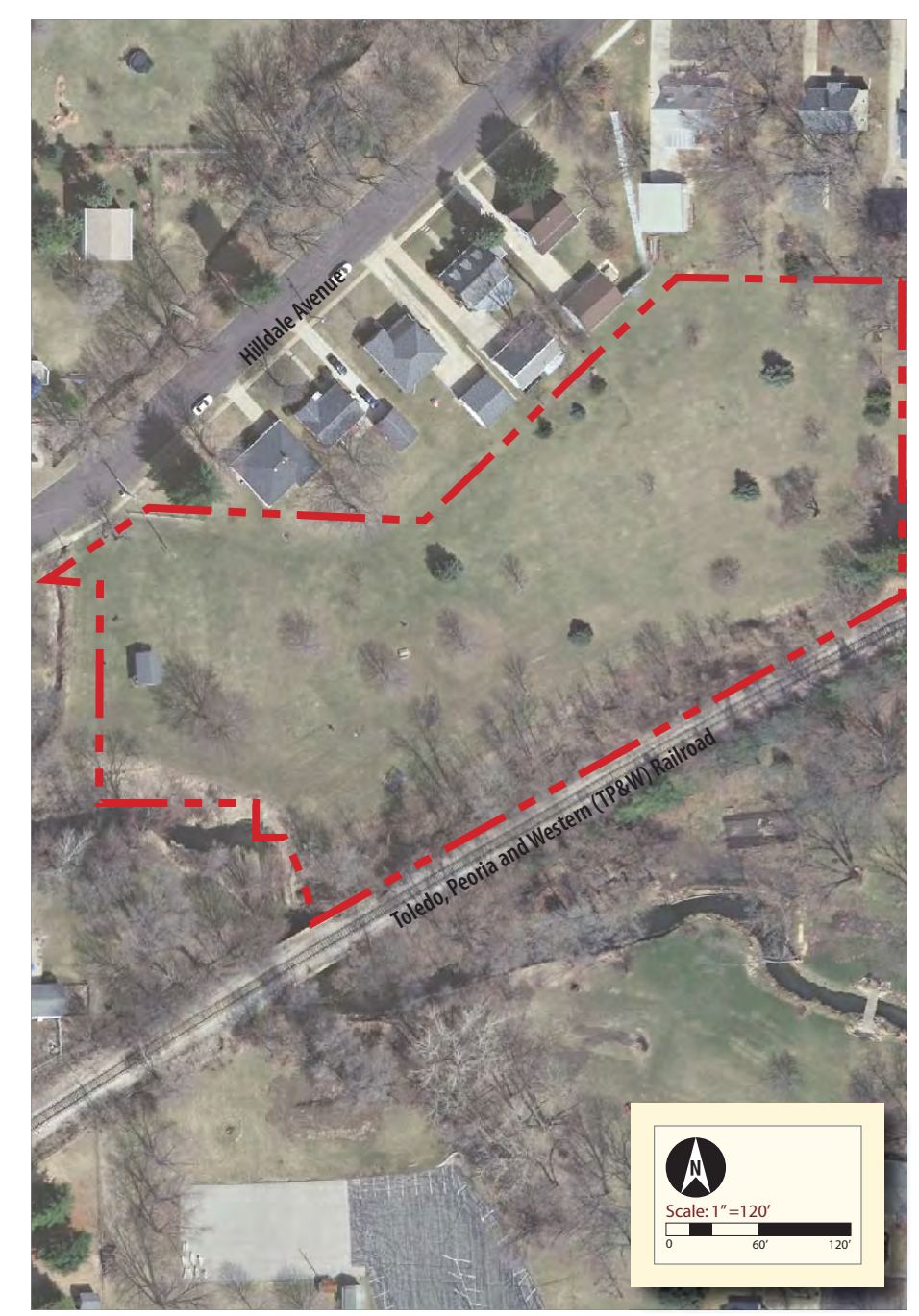
Aerial Photo of Sweitzer Park