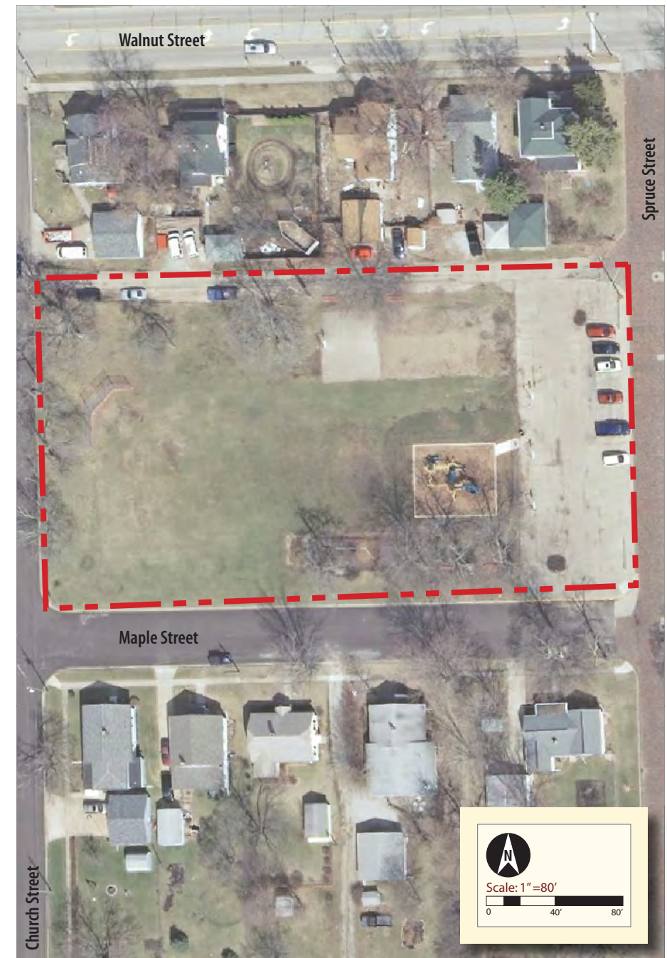
Aerial Photo of Recreation Facility Park