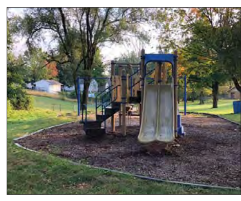
5-12 Play Structure and Swings (2 belt/2 tot)