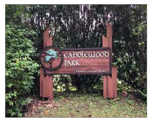
Park Identification Sign