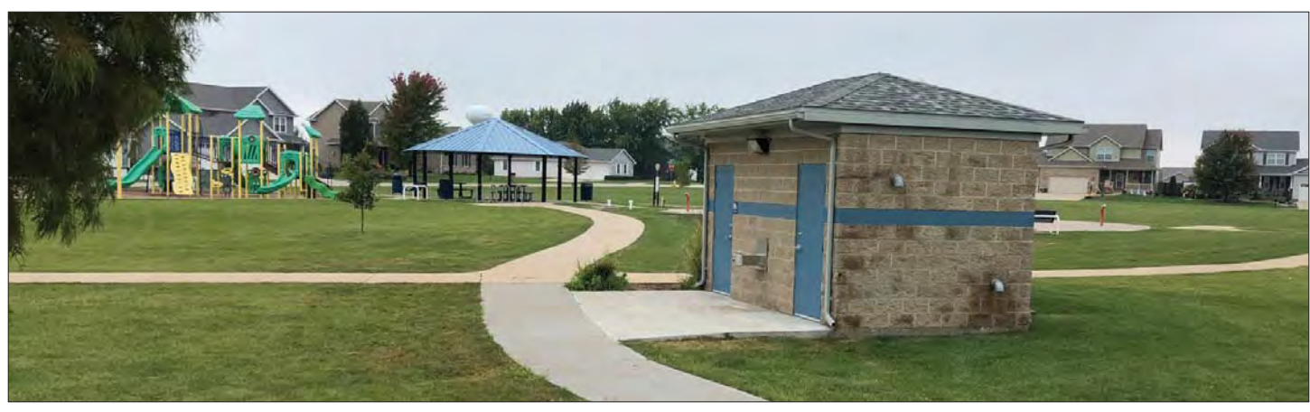
Permanent Restroom, Shelter, and 5-12 Play Structure