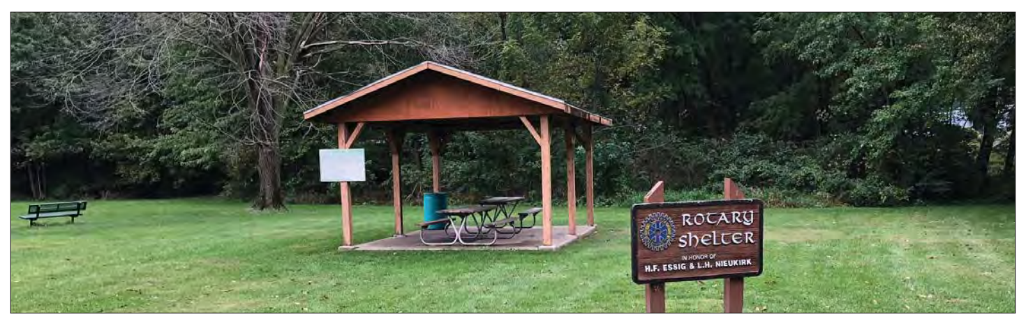
Shelter with Picnic Tables, Signage, Open Space, and Bench