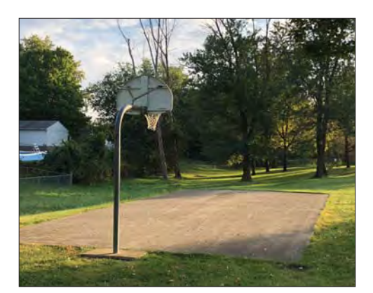
Half Basketball Court