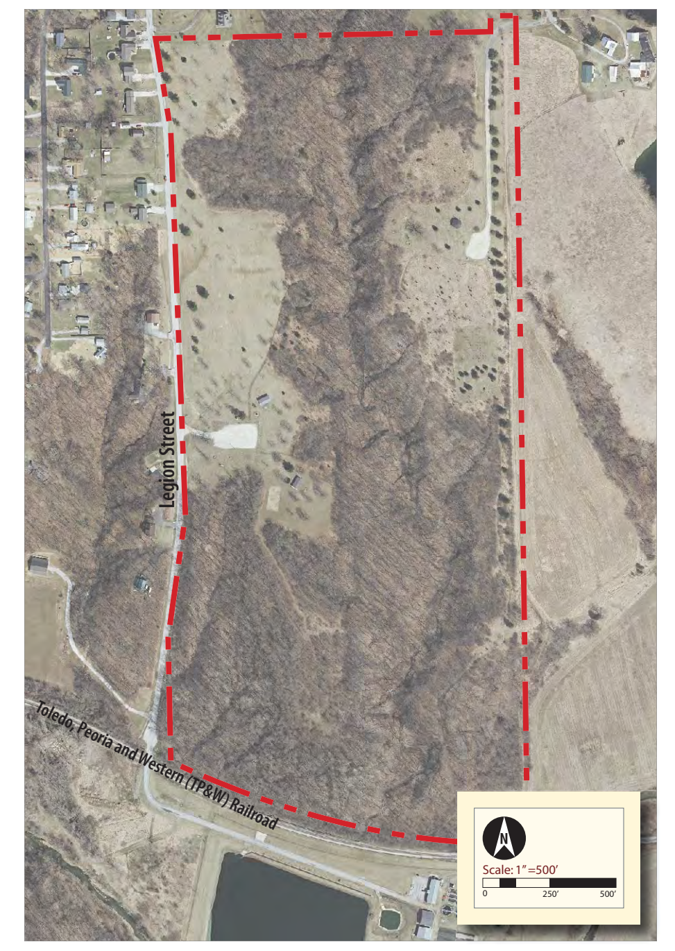
Aerial Photo of Meadow Valley Park