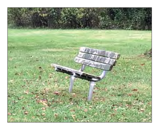
Park Bench (1 of 2)