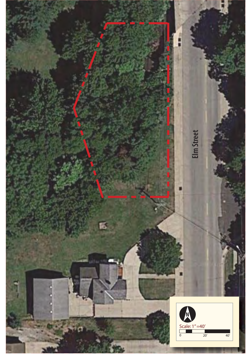
Aerial Photo of Ganzhorn Park