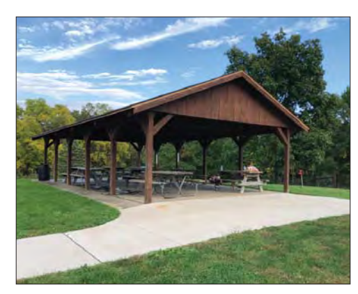
West Shelter with Picnic Tables