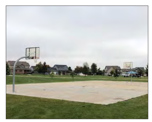
Full Basketball Court