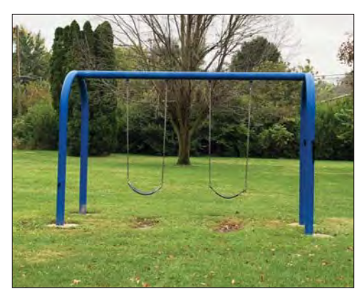
Swings (2 belt)